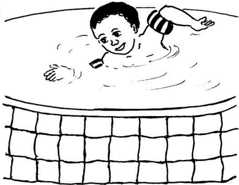
Nsobola okuwuga nagwo.