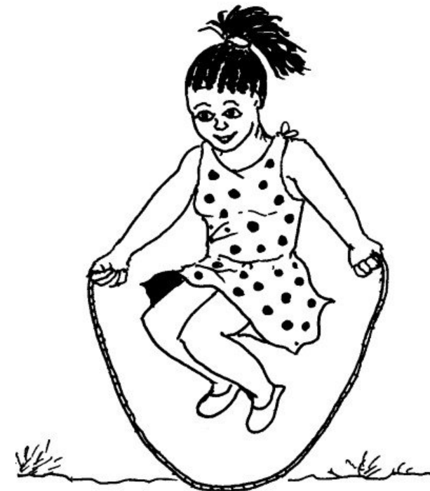
Nsobola okubuuka nagwo.