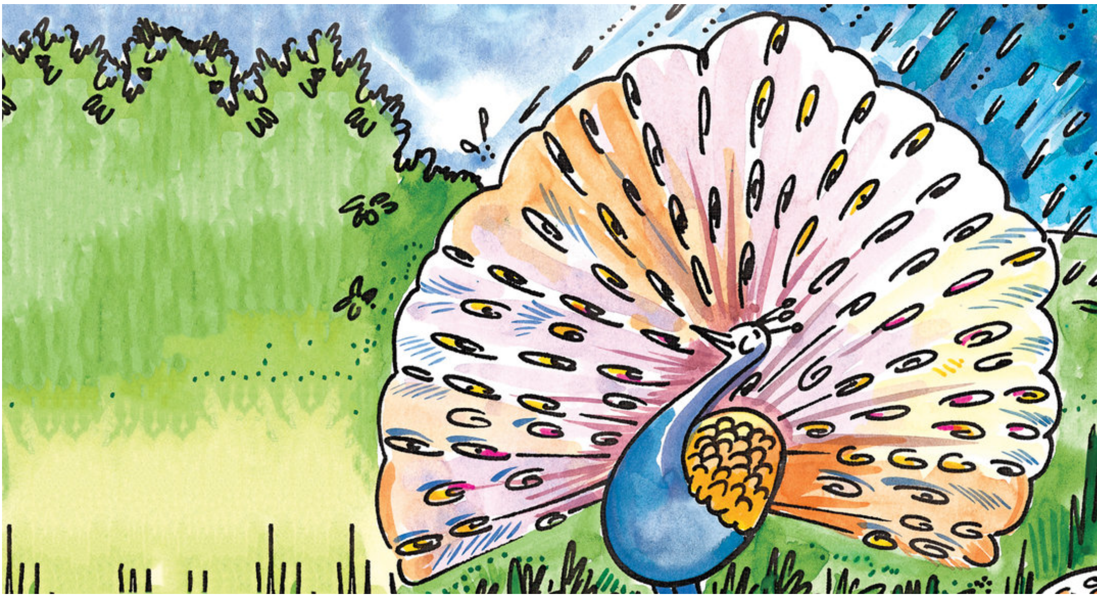
Peacock neeta ebiwawatiro byayo ebirungi nga bizina.