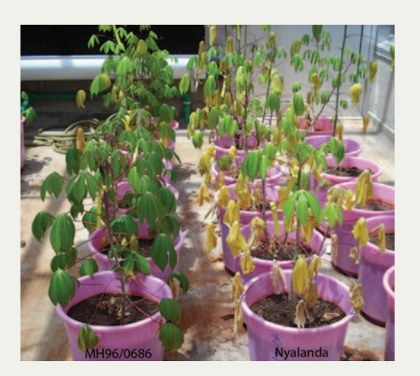
Fig. 1 Effect of drought stress on improved MH96/0686 cassava genotype and landrace Nyalanda. Stress treatment was gradually given to the plants 60 days after planting. Moisture stress was gradually applied to mimic natural field drought conditions. Improved MH96/0686 and farmer preferred landrace Nyalanda were differentially affected by drought stress conditions. After 10 days of gradual application of drought stress, MH96/0686 was less affected by water stress than Nyalanda, which exhibited marked wilting and other drought stress symptoms.

At TO (day 1/first day of drought treatment), the two genotypes were healthy and exhibited no readily observable symptoms of drought stress. After 10 days of reduced SMC, the two genotypes exhibited different levels of drought stress: the DS genotype Nyalanda showed severe wilting symptoms on the leaves, including mild chlorosis of upper leaves and senescence of many of the lower leaves, compared with more limited stress signs in the DT genotype MH96/0686 (Fig. 1). In order to assess the drought stress response in leaves that were at the onset of visible stress in the DS genotype at the 10-day time point, RWC and stomatal