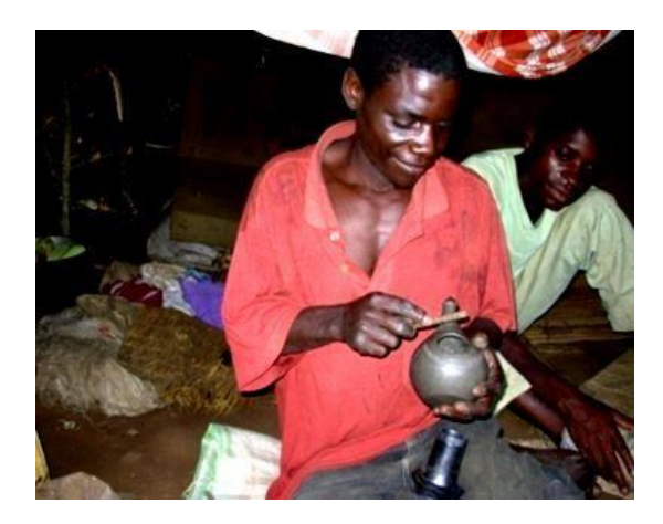
Figure 9. A male potter decorating a perfume pot using a bicycle axle.