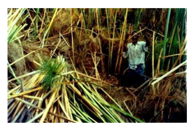
Figure 12. Gathering papyrus reeds for fuel to fire pots.