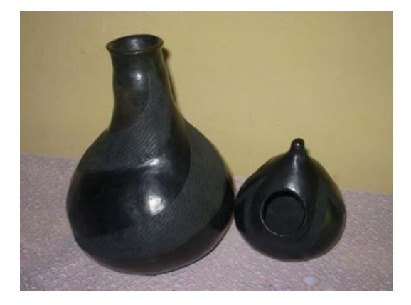
Figure 16. Special pots used by married couples.