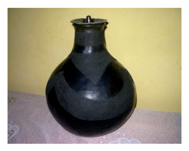
Figure 10. Fired and reduced water pot.

carried out as part of the craft rather that an art. Decoration on pots is symbolic and serves to transmit culture; it encodes, meditates and reinforces the pattern of social relationship.