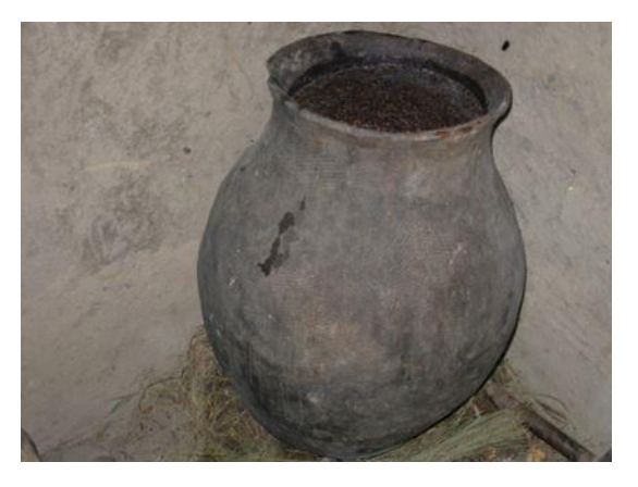
Figure 18. A pot used for storing local beer.

In Uganda and Ankole in particular, the local beer ( amarwa ) was and is still used as a medium of settling payment of bride price in many traditional homes.