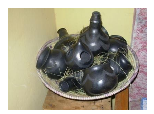
Figure 17. Special pots used during giveaway ceremonies.

through the porous clay, especially in grass thatched houses. Moreover, there is no electricity in villages to cool the drinks in refrigerators (Figure 18). Similarly, at Rushoga, pots were used to handle local beer during its production (Figure 19). Some of the pots are exclusively used for storage of local beer while others are still used as beer containers during the drinking party. It is still a practice, among the Banyankole, for members of the family to drink together from a pot as a sign of unity, especially when there is communal work, or when they are settling disputes. However, the culture of drinking communally is on the verge of decline because of the vigilance of the Health sector in the recent past, they that communicable diseases, have warned like tuberculosis are on the rise and so, such communal sharing should be avoided. Instead, during such functions, beer is brought in a pot and served from gourds to prevent the spread of diseases. Although the beer is served from gourds, the pot still serves as a symbol of unity among the Banyankore.