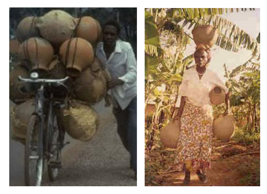
Figure 20. Potters transporting their products to the weekly market.

although at times, potters get orders from direct consumers for particular items, or vend them on a daily basis. The authors documented potters taking their pots to the weekly market. The transport system is still rudimental, where the common mode of transport is by head carriage, and on some occasions, potters get help from family members to push the wares on bicycles (Figure 20). On reaching the market, the wares are spread on the ground waiting for the buyers.