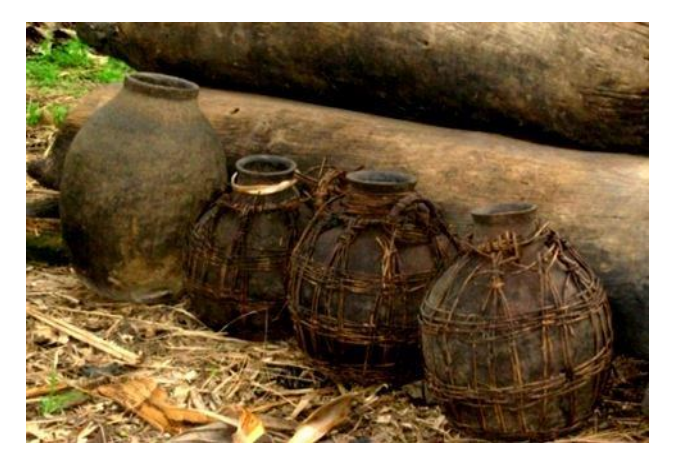
Figure 19. Pots used to handle and store local brew.

Whenever a man seeks to marry someone's daughter, he has to take some pots of beer (enjoga z'amarwa) to express his interest in the girl. He is then told to pay a given number of cows and pots of beer, as part of bride price. However, with modernity, many urban and middle class families give a certain number of crates of beer (bottled) and soft drinks. For Christian families of the Anglican faith, particularly the born-again, crates of soft drinks, a bag of sugar, and tea leaves, are requested instead of pots of beer, on top of settling the payment for bride price. Bride price is considered to unite the two families of the bride and groom. From then on, the two families can eat and drink together since they have been united by sharing the drink. Serving beer to guests from a pot is a cultural practice among the Banyankore, and it symbolises hospitality and cultural identity. However, there are special pots, drinking vases, (orunywero) meant for the head of the family or special quests.