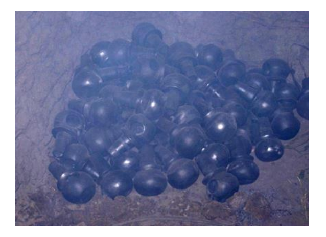
Figure 15. Reduced fumigators after firing.

especially those which are meant to handle local liquids. The researchers were informed that after firing, the pots are filled with banana peelings and water; and are placed on a fire place cooked when the pot is covered with a banana leaves. This will ensure that the pores are properly sealed and the pot is ready to handle either water or beer without leaking. In addition, pots for handling beer are given another touch by weaving rings both at the bottom and the neck, which are connected by strings from the neck to bottom and sideways, using either enshuri (thorny creepers) or banana fibres ( ekifunga ). This will aid handling the pot when filled with the beer brew.