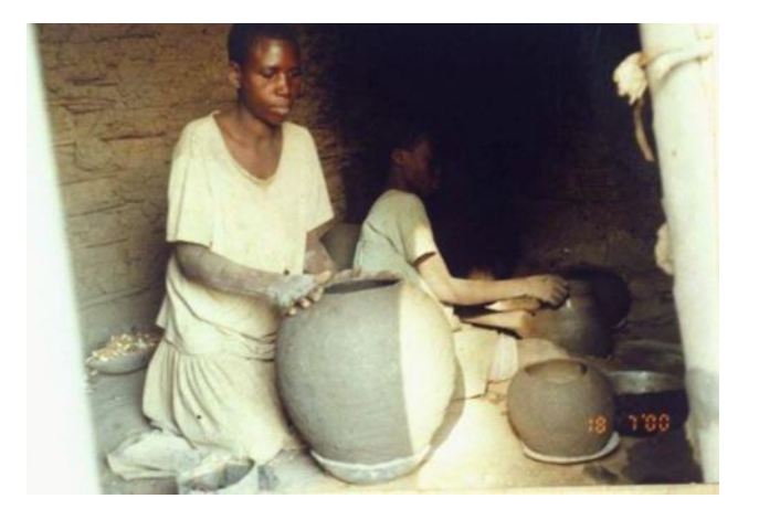
Figure 1. Learning pottery skills from her mother.

argues that pottery developed as a response to the needs of humankind. Pots became containers and dispensers – pots of purpose. Once the basic needs became evident, forms were developed to serve them. For Barley (1994:69) and Zeleza (1993:211), pots are naturally used for storage and cooking of liquids; but have a much wider role. The African usage is only superficially different from the western; appropriate pottery is assigned according to the qualities of the food, uses and events, as well as transmitting messages about participants and their relationship.