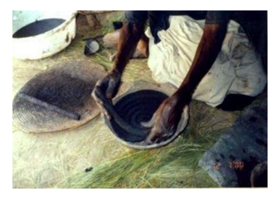
Figure 5. Initial stages of making a pot using coils.