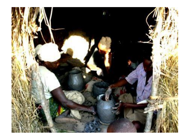
Figure 7. Batwa women making pots by drawing.