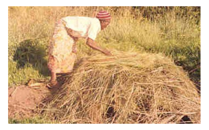
Figure 13. Covering green ware with lemon grass.

the woman to give birth, after a long period of labour pains.