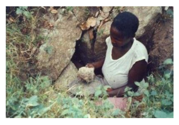
Figure 4. Searching for temper from an igneous rock.

evenly, and reduces shrinkage during firing reducing the risk of cracking. Thirdly, it helps to prevent breakage and bursting during firing and it increases durability.