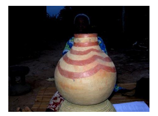
Figure 11. Water pot fired under oxidation.