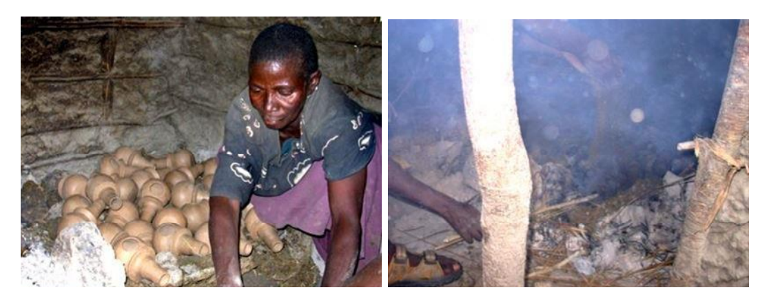
Figure 14. Stacking and firing fumigators using cow dung.