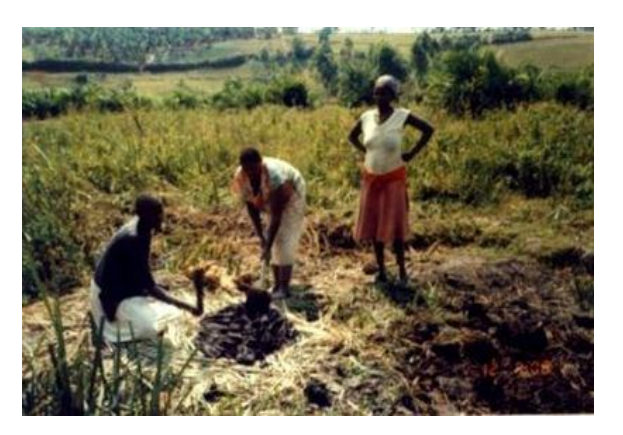
Figure 2. Pounding clay with hoes after extraction.

According to Appau et al. (2013:64), in Ghana women in their menstrual periods were not allowed to engage in