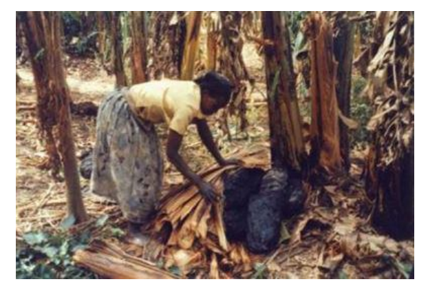
Figure 3. Covering clay with emborera to keep it moist.