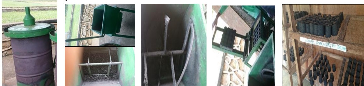
Figure 3: L-R- Carbonizer; Residue crashing machine; Mixer; Compressor and Drying racks used for the study

Carbonized briquette samples were obtained from Mukono Appropriate Technology Centre (ATC)