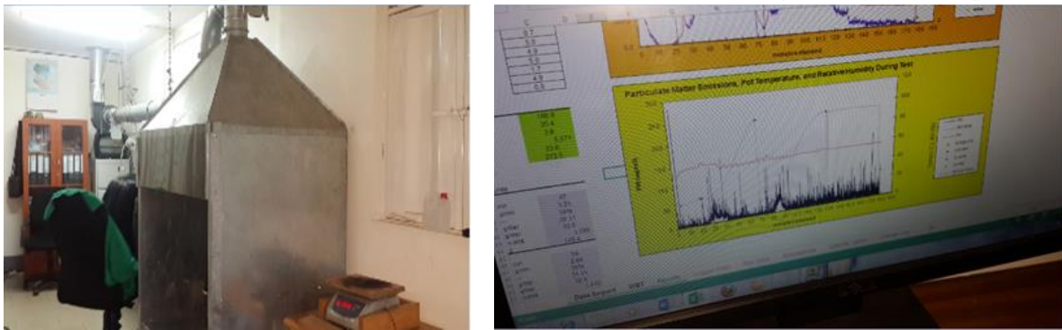
Figure 4: Left- Set up of LEM; R- Particulate matter emissions reading during WBT experiment

Energy and Energy Conservation (CREEC); Regional Knowledge and Transfer Centre (RKTC) laboratory, Makerere University while the Gross calorific value and moisture content tests were performed at Nyabyeya Forestry College, Masindi District. Laboratory Emissions Monitoring System –LEMS (Figure 4) was used to measure levels of emissions and indoor emissions of carbon monoxide (CO) produced while the fuels were being used to cook. A gravimetric system (Figure 4) was used to determine the mass of PM 2.5 micrometres emitted from fuels. All the experiments investigated physical and chemical properties of the agricultural waste-based briquette samples against the conventional sources of firewood and charcoal.