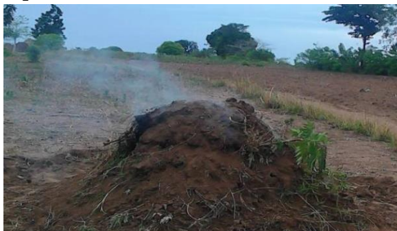
Figure 2: Charcoal making process during the experiment

with the charring of wood into good quality charcoal. Upon closing the whole pile, controlled openings were created on top of the kiln to keep the fire from dying out before all the firewood charred into charcoal. The kiln was left to char completely until all the wood was burnt into charcoal. This took about five days, after which it was opened. A completely burnt kiln is locally detected by reduced smoke emission and the whole kiln being sunk. This method was adopted for this study. Upon realisation that the kiln had completely burnt, the charcoal was collected while extinguishing the remaining fire with sand. This charcoal making technology is the most commonly used method in all charcoal burning communities of Uganda. It is an almost no-cost technology, except if the wood for making the charcoal is purchased.