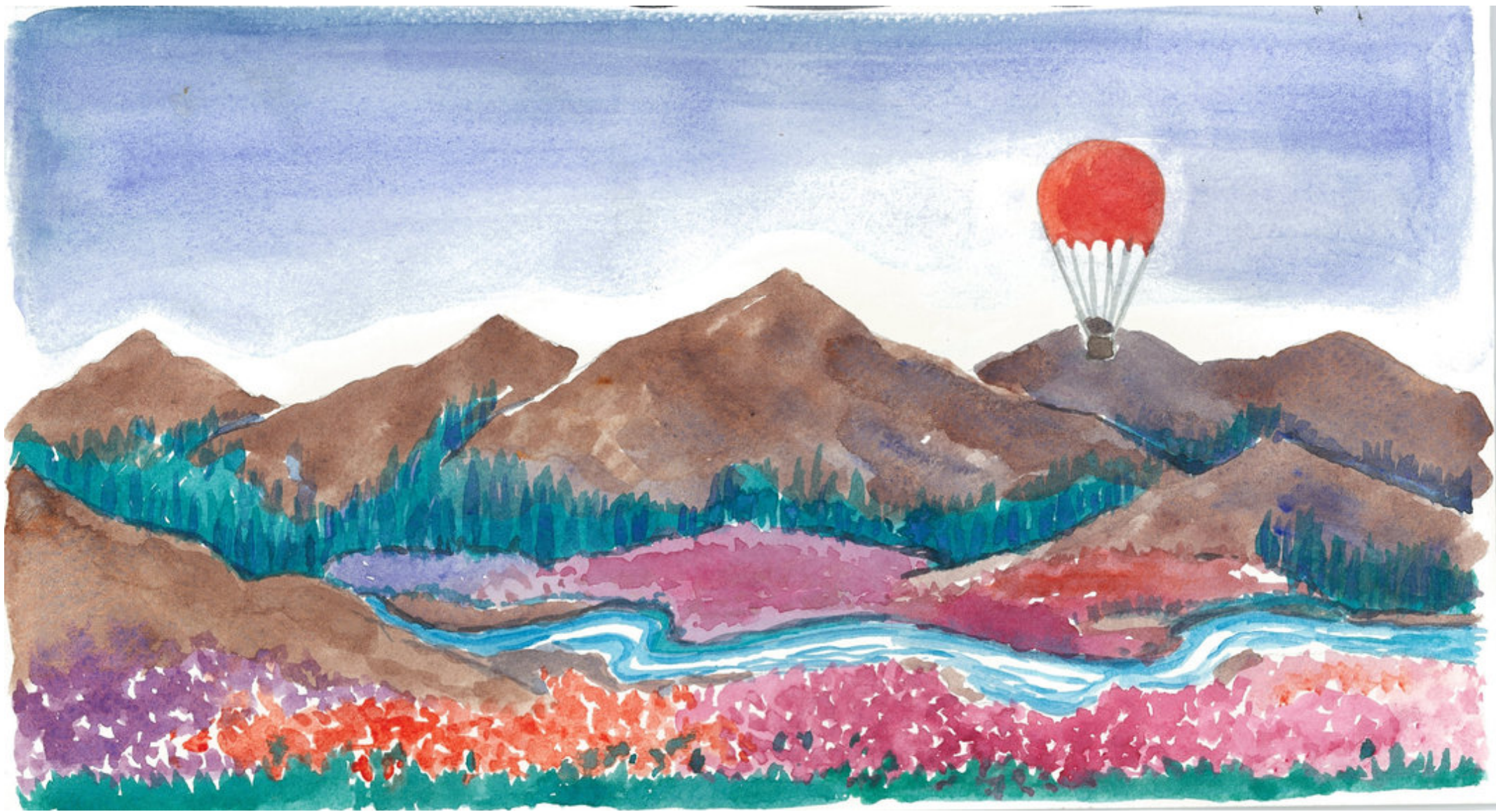
Mbuuke ensozi ne ebibiria ebyetooloire Busoga.