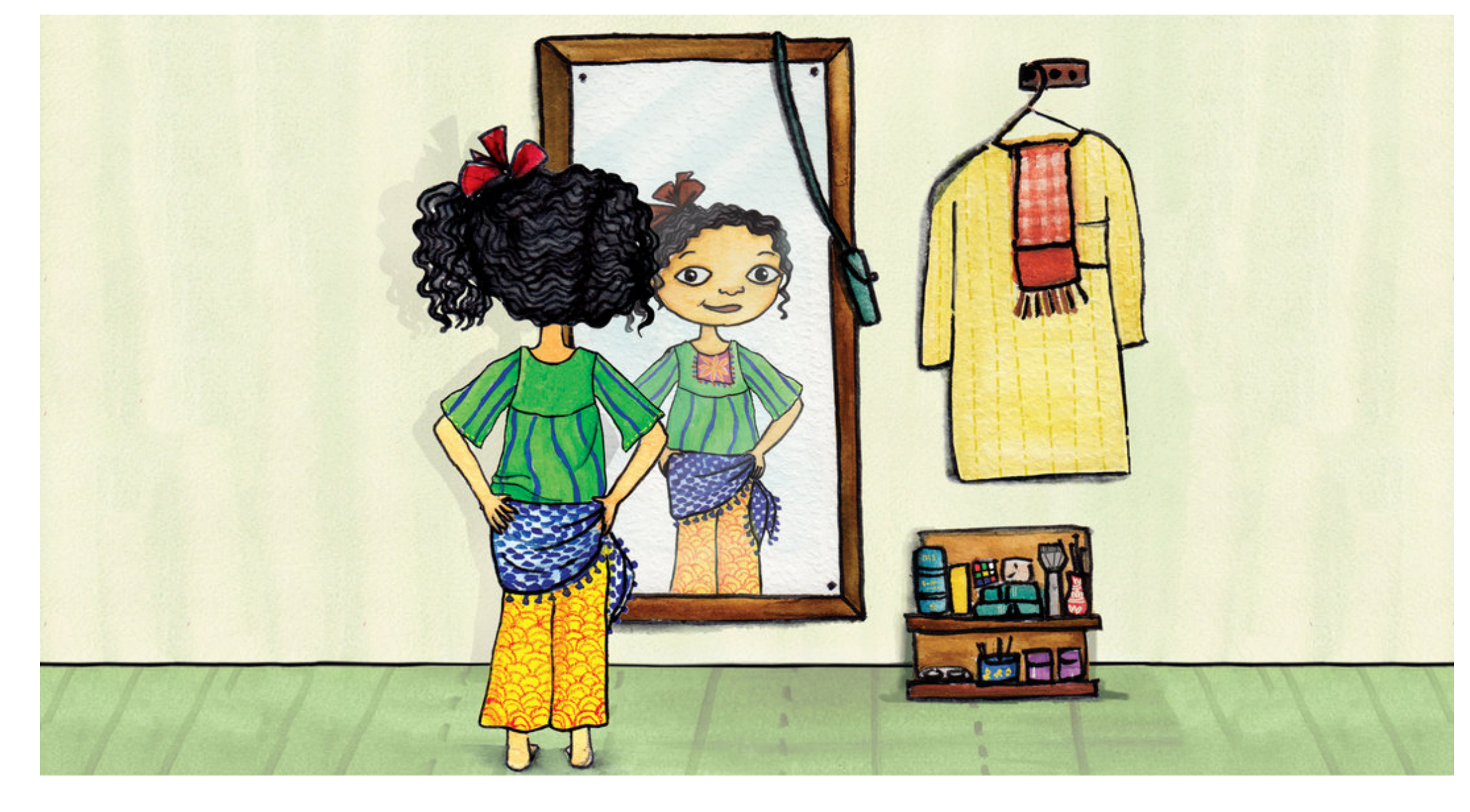
.....kutabula ni kugata zigubo zino mujelu yesi eganamo chelelo!