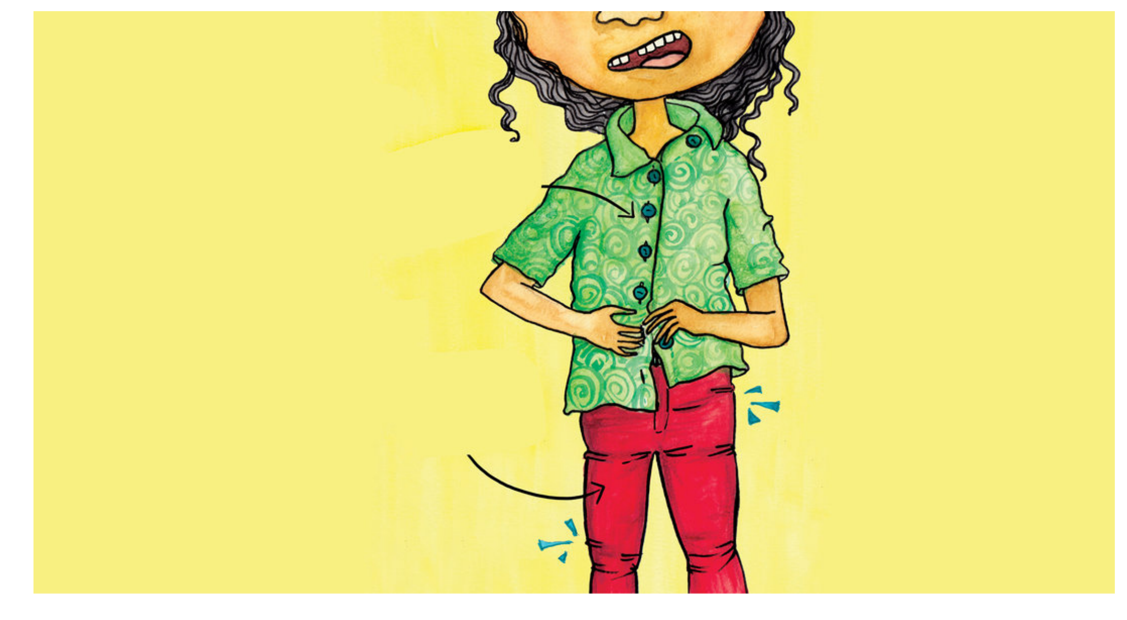
Zisanti ze nga mapensa zisubuwa. Zipale zimina nabi.