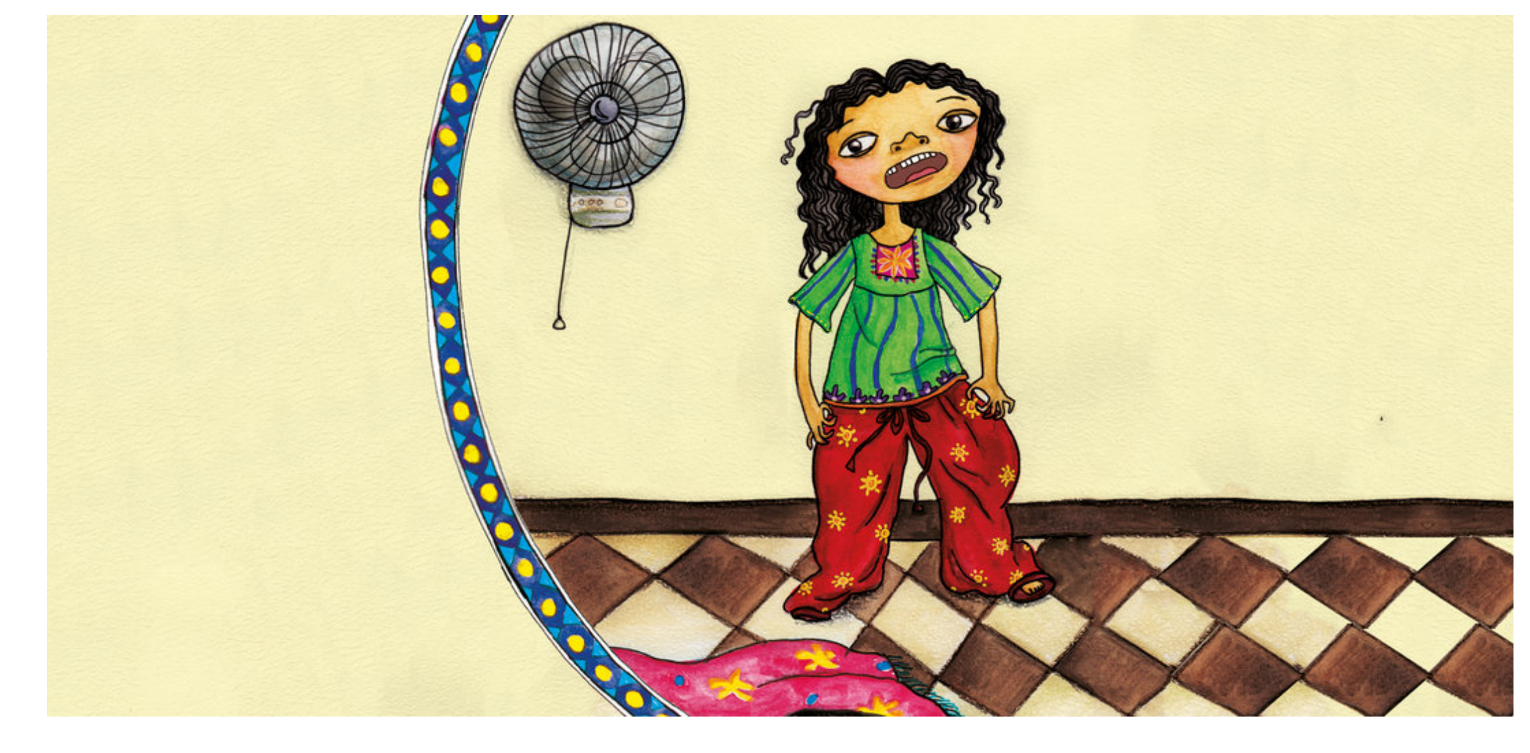
Esalwari egwabugwe. Ezari ye gold ezangala.