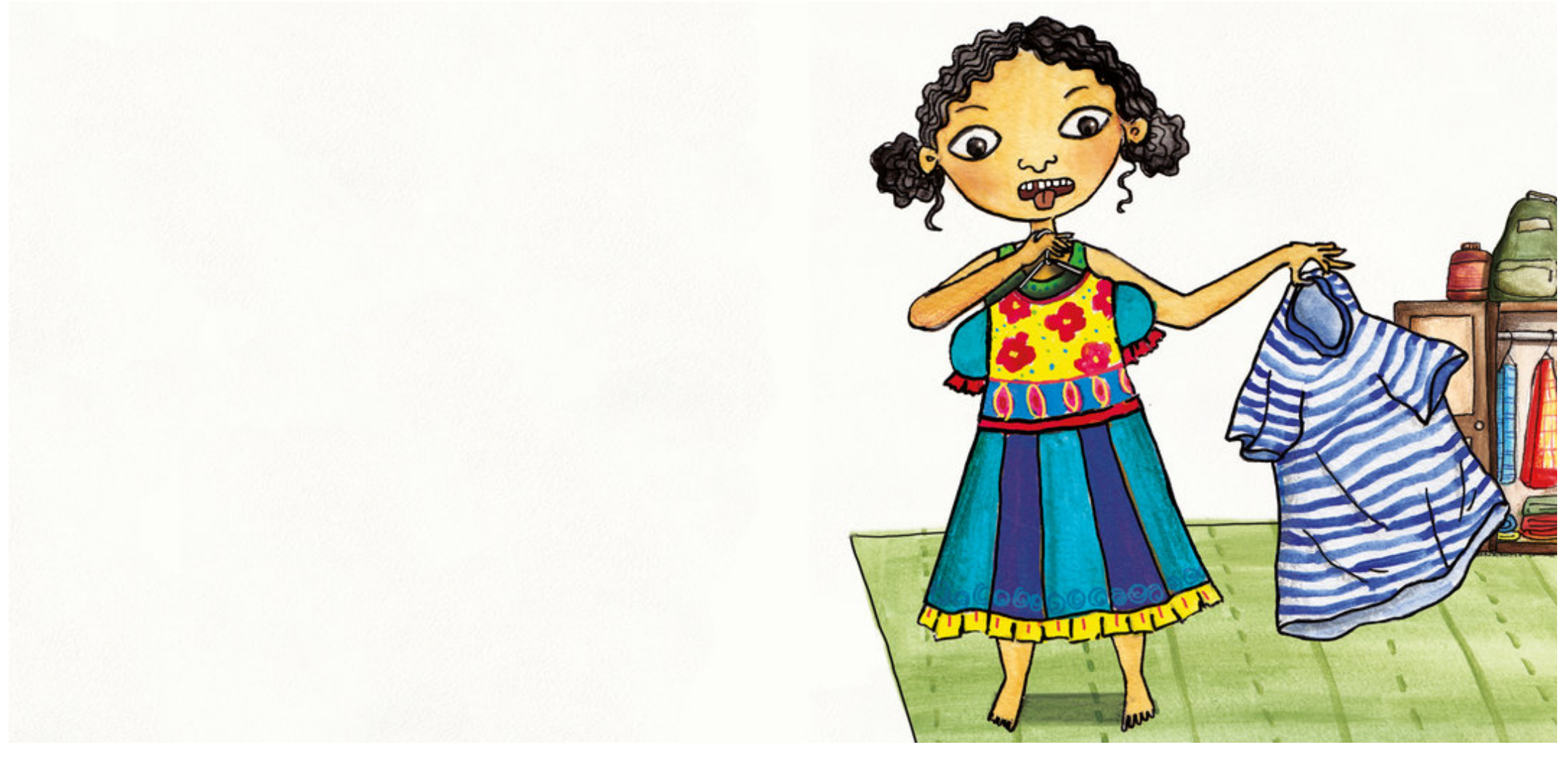
Chitetenyi cholesa nabi. Etishirt yo yaya woese umuside?uhmm eboneka bulala!