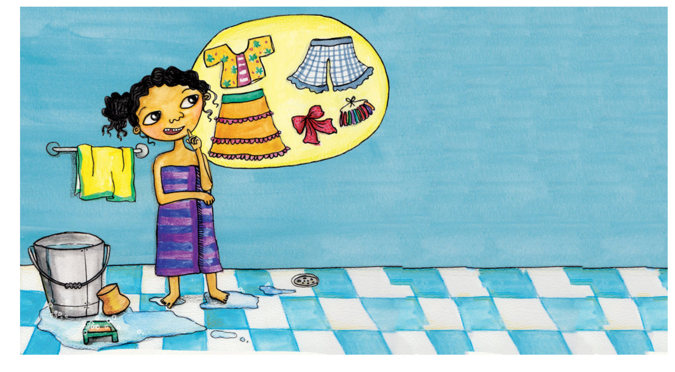
Elilwo yesi uwulira biselabila uti kawo eguvo edayi nda? Ese ni wulira!