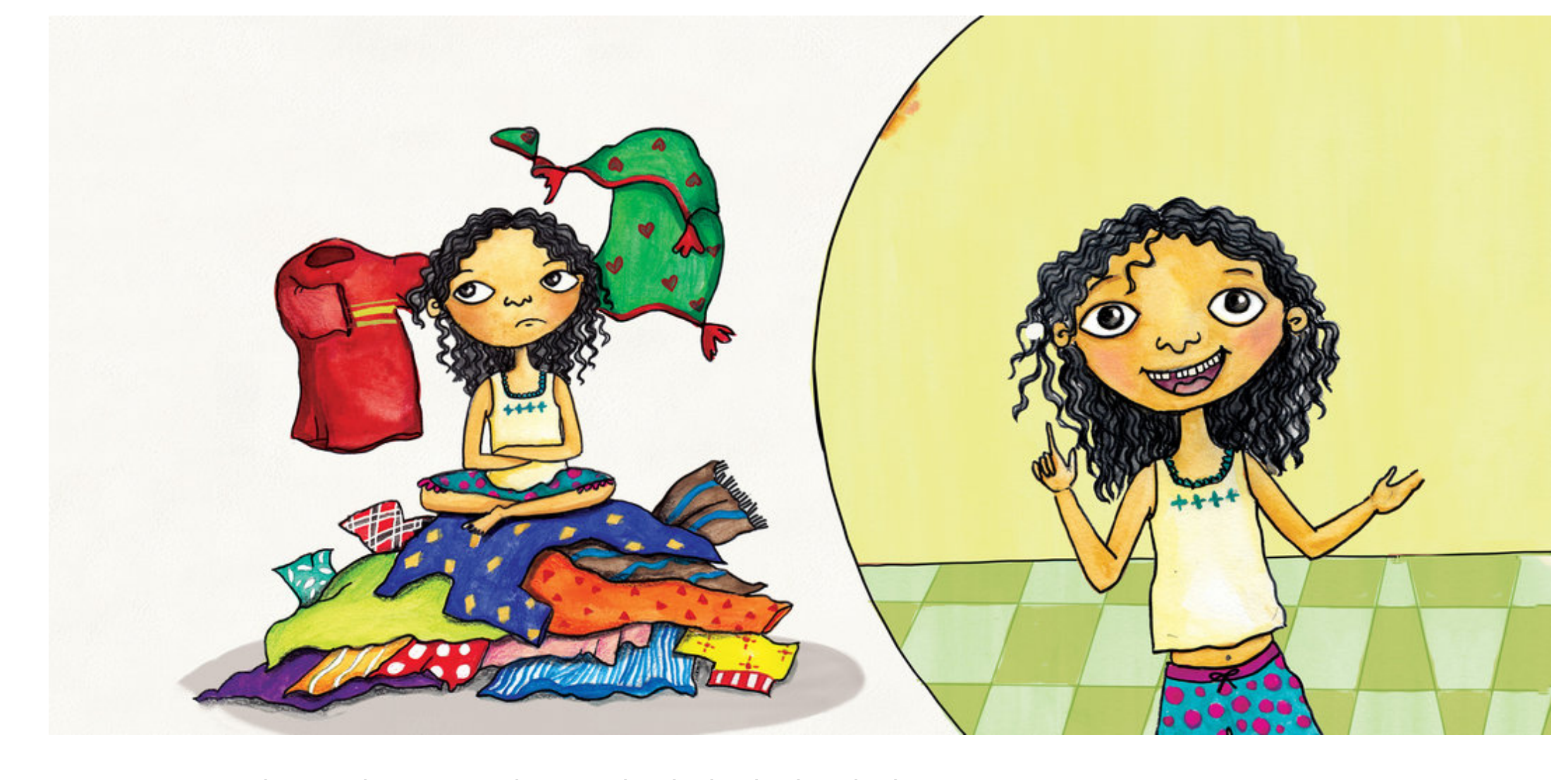
Ziguvo zino zili nga ziloma zinti ,'kunamuletela bizibu lunaku lwoesi.' Nga nasalilewo chelelo...